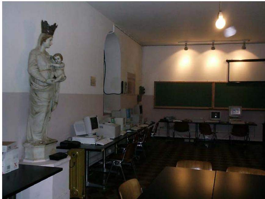
the computing room