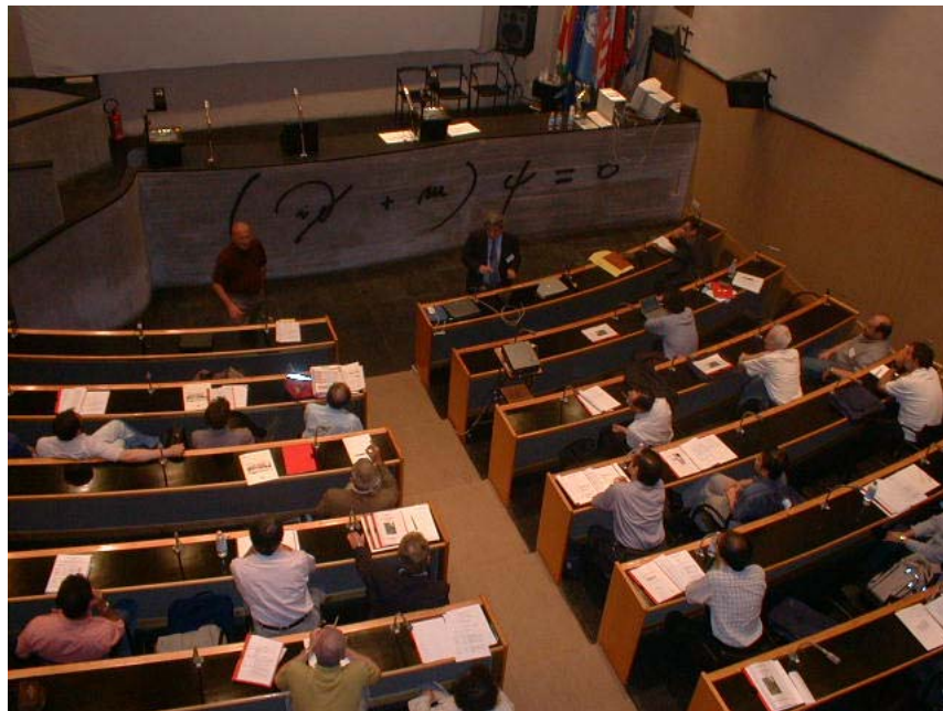
the P.A.M. Dirac lecture hall